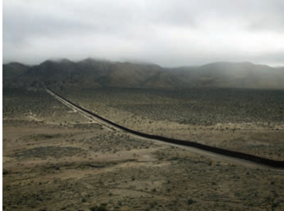
Richard Misrach, American, born 1949, Wall, Jacumba, California, (El Muro Jacumba, California) (detail), 2009