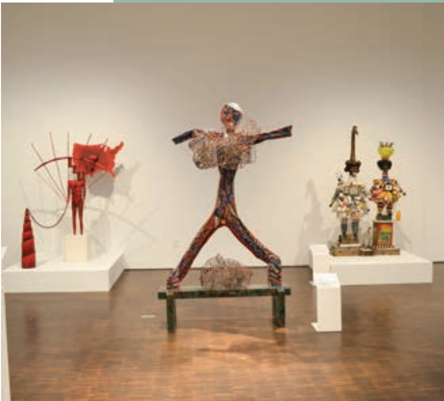
Installation views of Dimensional: 3D Works from the Figge Collection