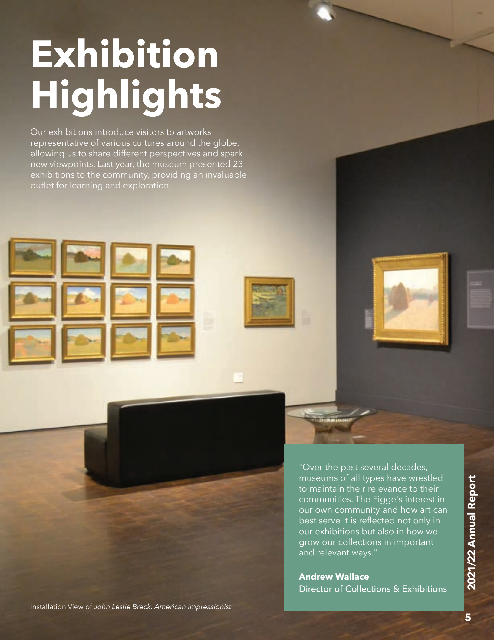
Installation View of John Leslie Breck: American Impressionist

Our exhibitions introduce visitors to artworks representative of various cultures around the globe, allowing us to share different perspectives and spark new viewpoints. Last year, the museum presented 23 exhibitions to the community, providing an invaluable outlet for learning and exploration.